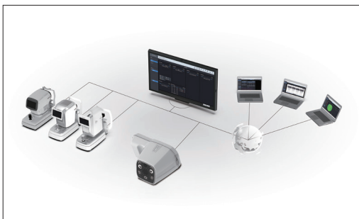
Network in Huvitz Integrated Image Server(HIIS-1)